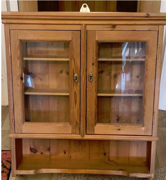
Large Bathroom cabinet £30