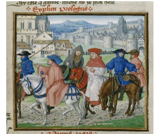
Pilgrims to Canterbury, 15 th cent,

You are welcome to join in the service online at: https://www.canterbury-cathedral.org/worship/online-worship/#evensong