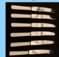
6 Knives £3