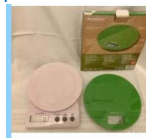
Kitchen Scales £2 each