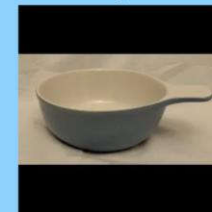
Corning Ware Bowl £3