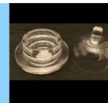
Glass Butter Dish £4