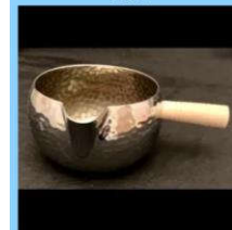
Milk Jug £4